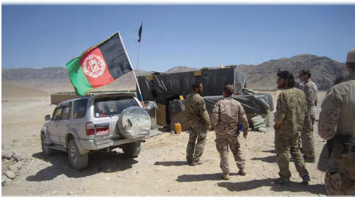
Coalition members visit Afghan Local Police bazaar checkpoint.

By the end of 2006, the insurgency surrounded FOB Kaufman. Insurgent fighters mined the main roads leading from the base to the surrounding district and were emboldened by greater numbers and greater discipline, as well by the skills foreign fighters brought to the battlefield. Local villagers fled the area, enlisted with the Taliban, or were coerced to work for the insurgency. Beginning in 2010, there was a concerted effort by U.S. and Afghan forces to push out beyond FOB Kaufman, to engage with local leaders, and to raise an Afghan Local Police force. It began by increasing the number of Special Forces teams in the area from one to four and establishing small