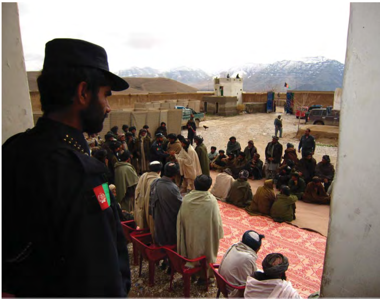
Afghan National Police shura with Shahid-e-Hasas village elders.

Ministry of Interior vetting, infiltration by insurgents, and its monopolization by local powerbrokers. The next version of local police, called Afghan Public Protection Program, began in Wardak Province in 2009, and although it added governance and community vetting to its program, the commander of the force at the time disregarded local sentiment and never emphasized governance. Neither of these programs utilized U.S. Special Operations Forces in the recruiting, vetting, or training of these forces or in the administration of the program, which limited its overall effectiveness. While success was elusive, many lessons were learned that proved vital to the later success of the Village Stability Operations program as well as Afghan Local Police. The next step in the evolution of the program was the creation of a Community Defense Initiative, later renamed the Local Defense Initiative. Approved in July 2009,